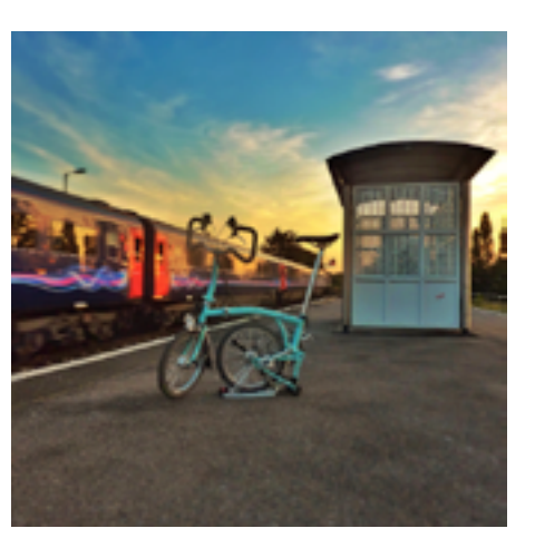
Summer Evening at Bedminster Station

Shortlisted: London Fixed Gear, Single Speed Ladies Forum for 'LFGSS Ladies Visit the Owls' and Transform Scotland for 'Interchange Project.'