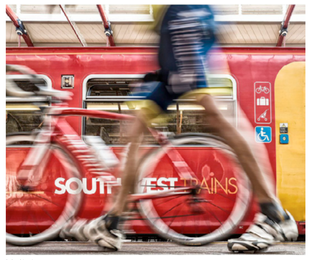
By Royal Appointment