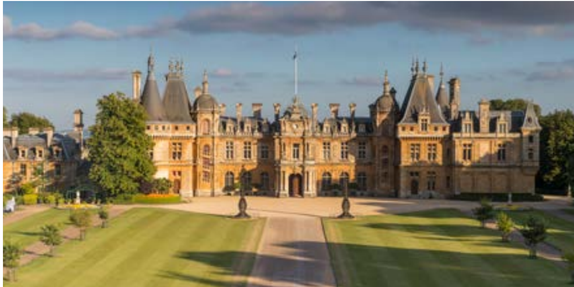
Waddesdon Manor

The creation of a new 2.5 mile walking and cycling route connecting Aylesbury with Waddesdon Village and Waddesdon Manor is an outstanding example of partnership working to improve cycle access to and from a rural railway station to local amenities. Opened in 2018 the route provides a pleasant and safe, traffic free alternative to the very busy